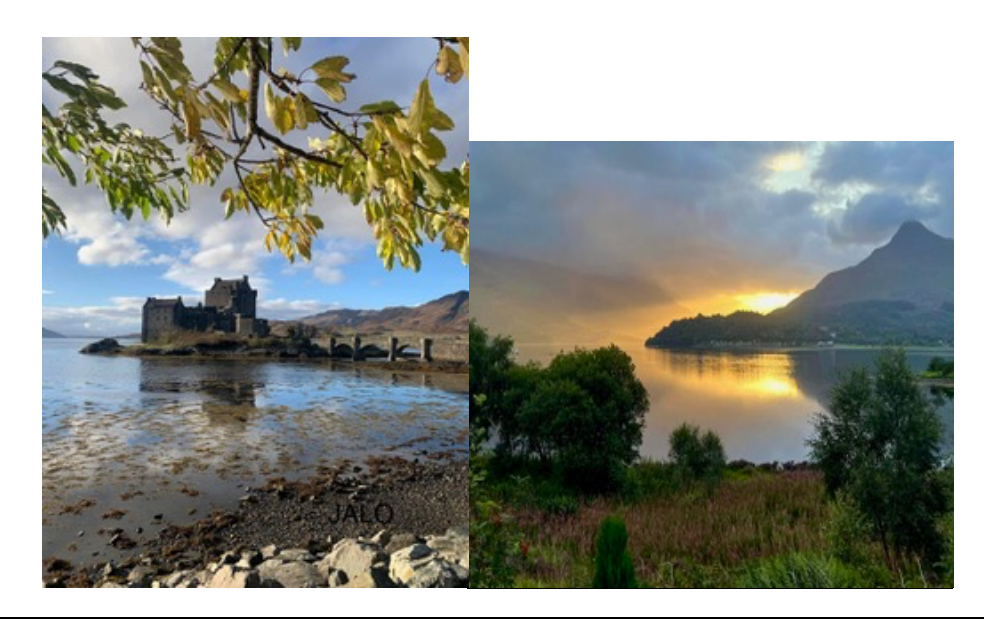
We are entering the "giving season."

We currently have 19 people traveling to Scotland for the Isles & Glen 12-day tour September 21-Oct 2, 2024. I have 8 spaces left for anyone who's still interested in coming along. Contact Fred at <u>fmetzger@zoominternet.net</u> for more information.